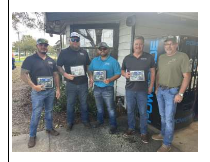
3rd Place Team: Case Power & Equipment Score: 334