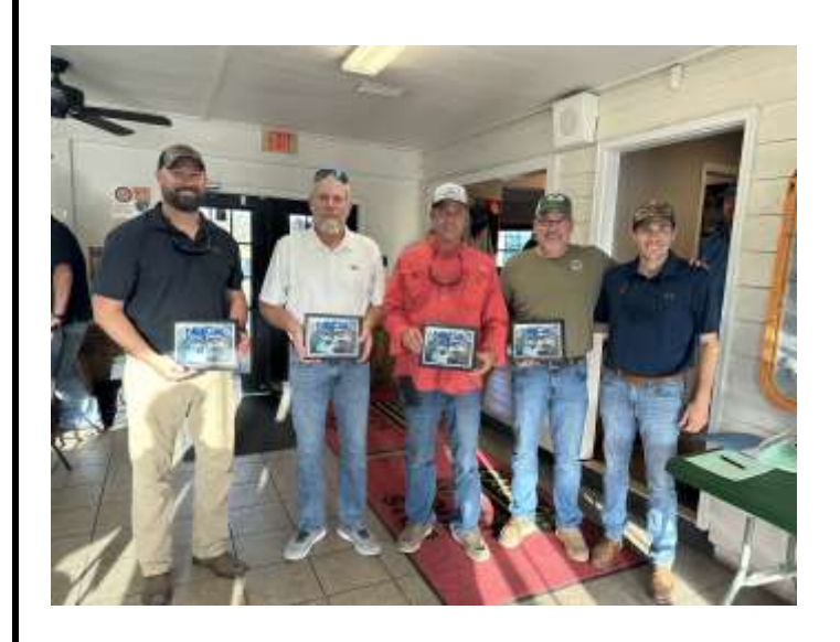
3rd Place Team: TB Landmark Score: 351