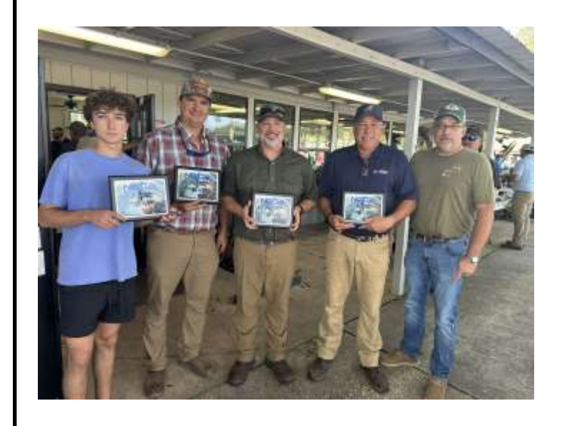
1st Place Team: Nextran Score: 358